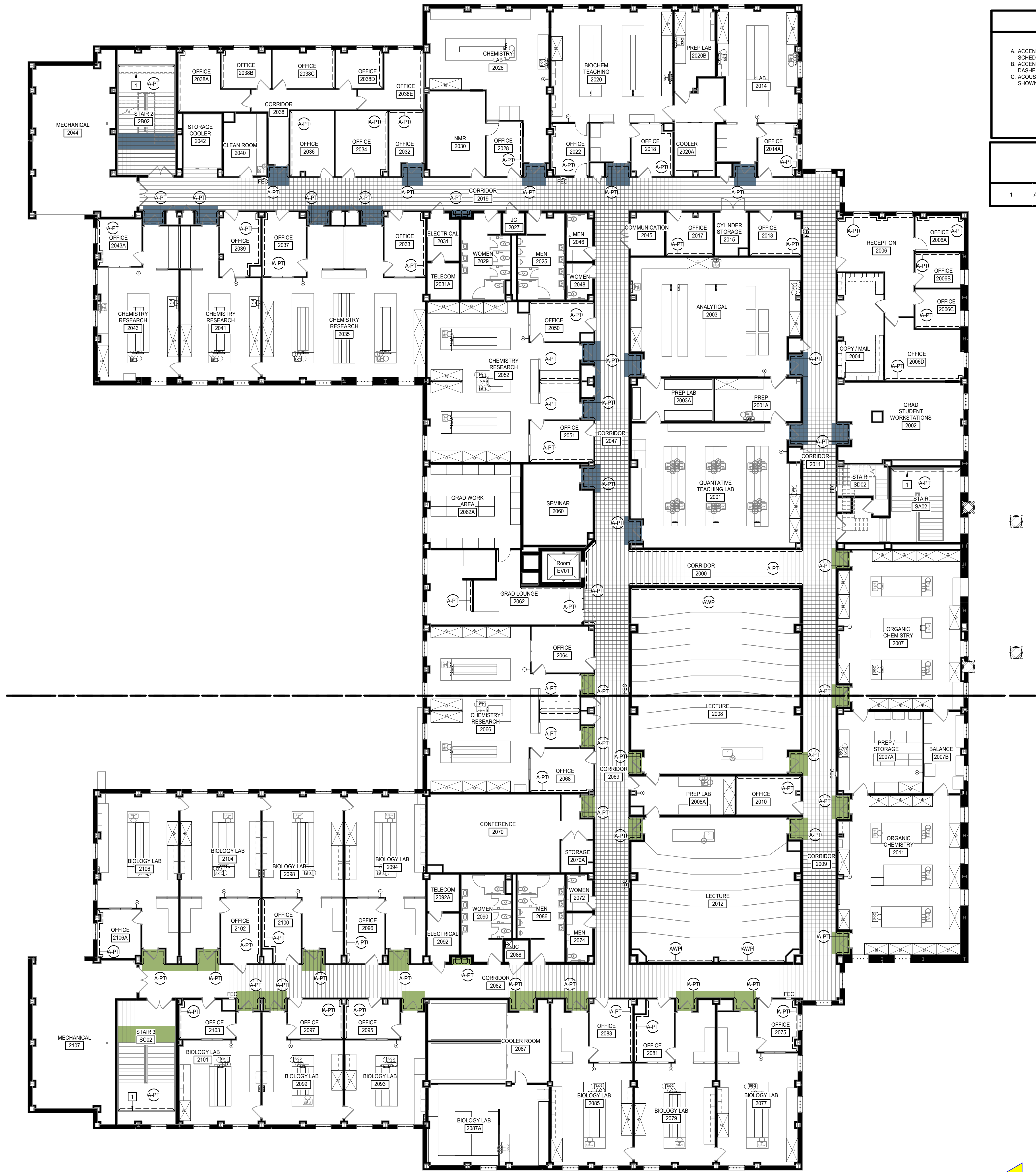
1 SECOND FLOOR ACCENT FINISH PLAN 3/32" = 1'-0"